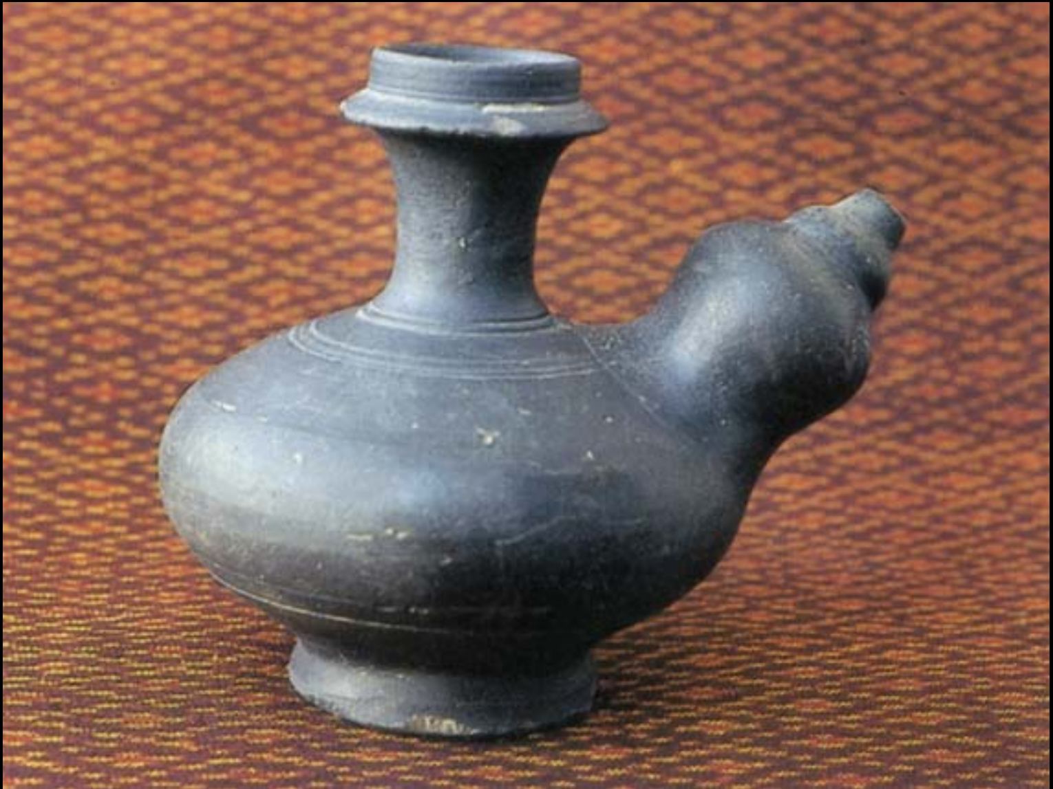
Kendi; ht. 10 cm.