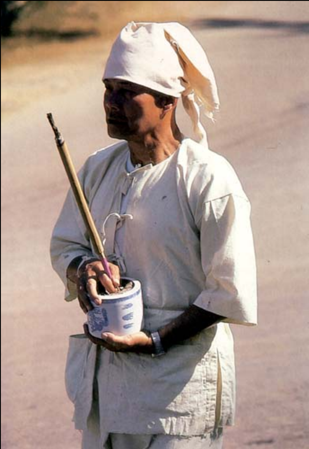
Funeral ceremony; Nan Province, Thailand.