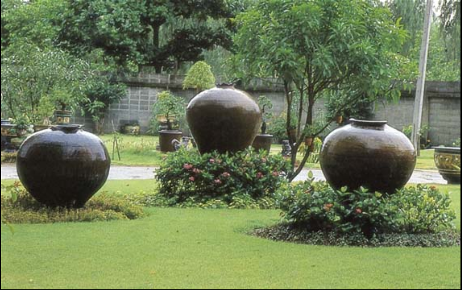
Jars (Sisatchanalai, Thailand); Garden at Tao Hung Thai Kilns, Ratchaburi, Thailand (Vance Childress).