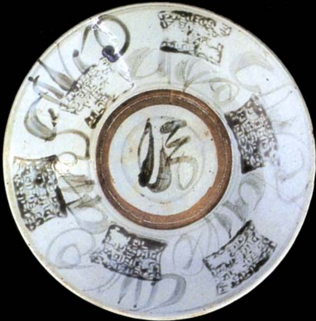
Plate (blue and white tableware); Chinese; diam. 27 cm.