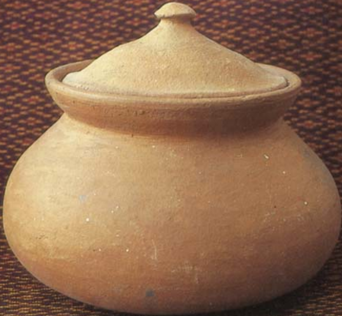
Utilitarian pot; diam. 13 cm.