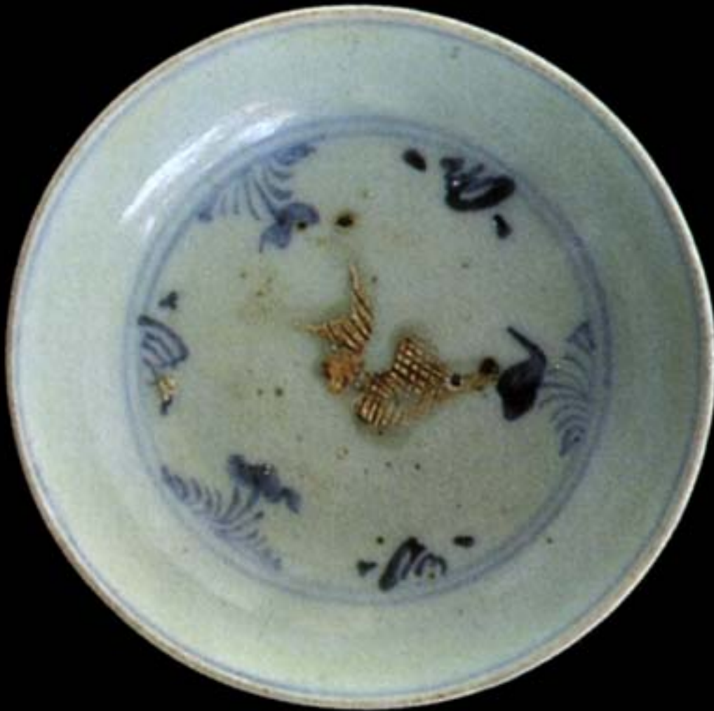
Hole-bottom saucer; Chinese; diam. 12 cm.