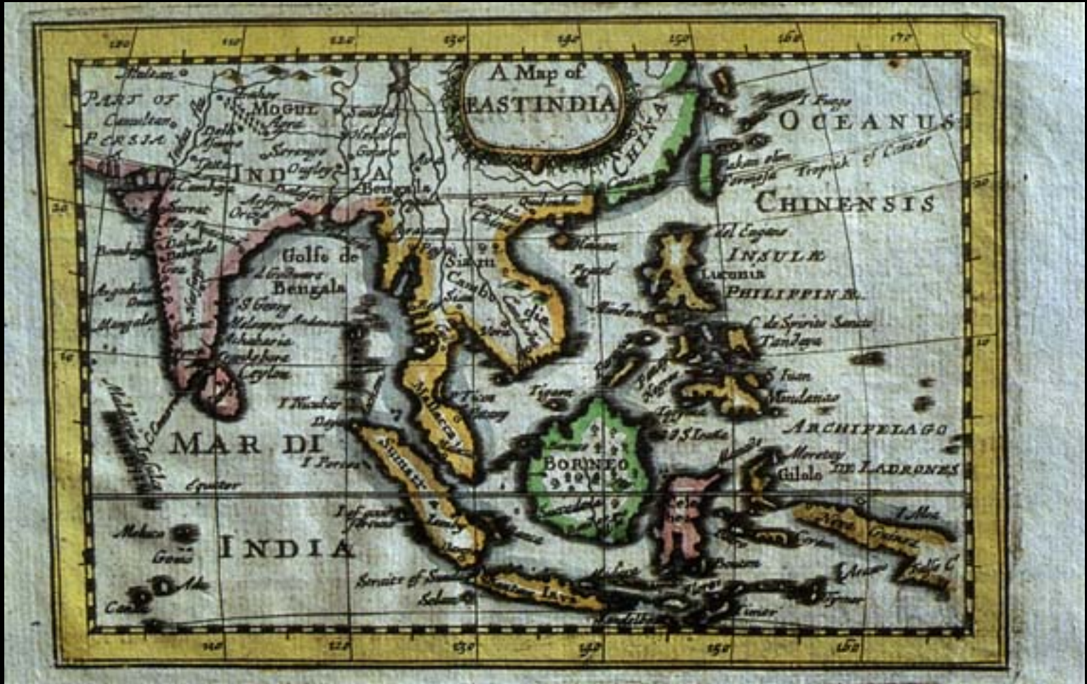
A map of East India; Giovanni Botero (1599); 12.0 x 5.8 cm.