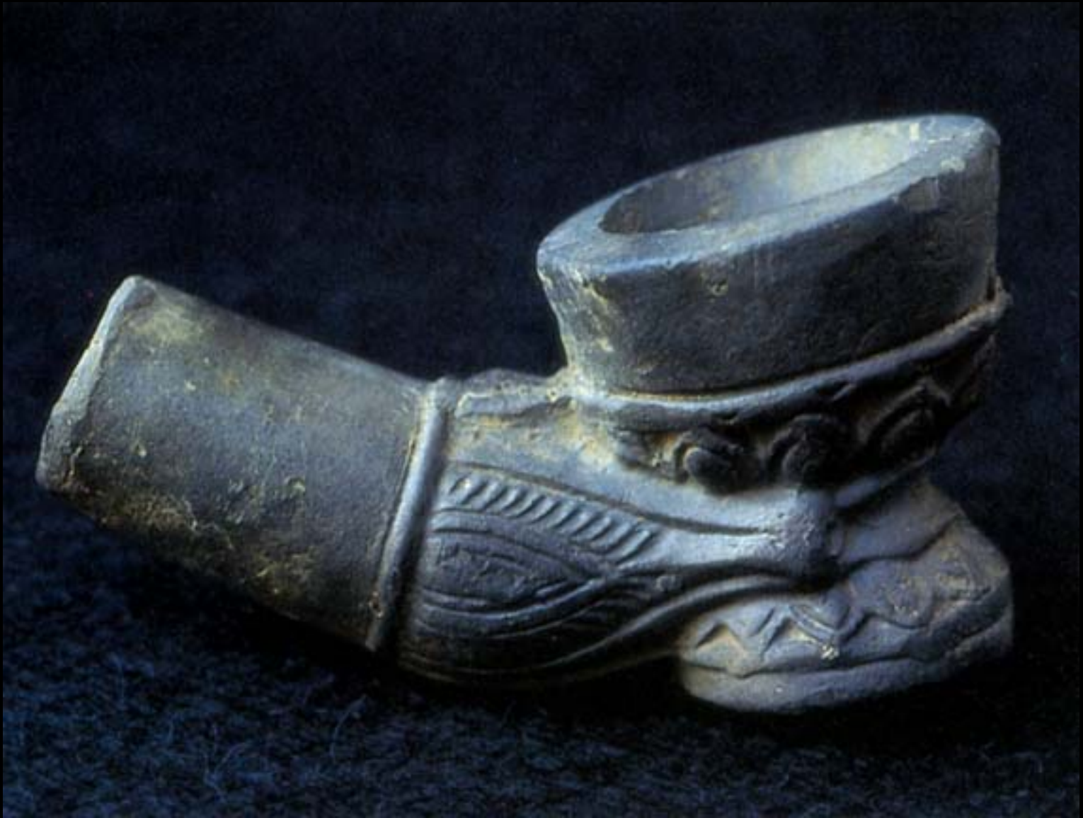
Pipe head; 1. 7.5 cm.