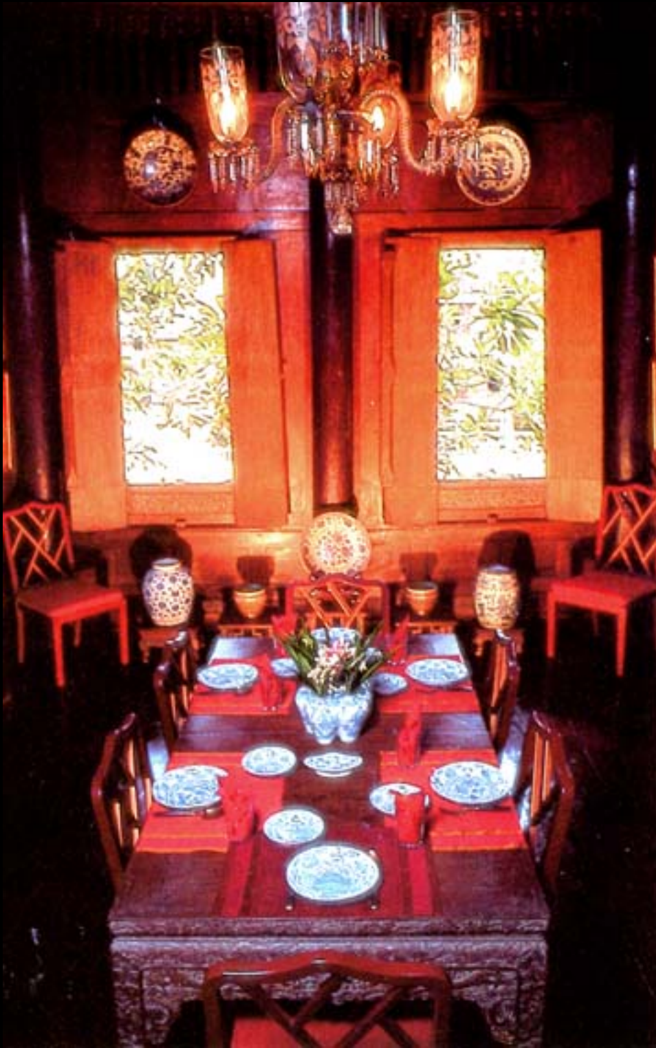
The Jim Thompson House, Bangkok, Thailand.