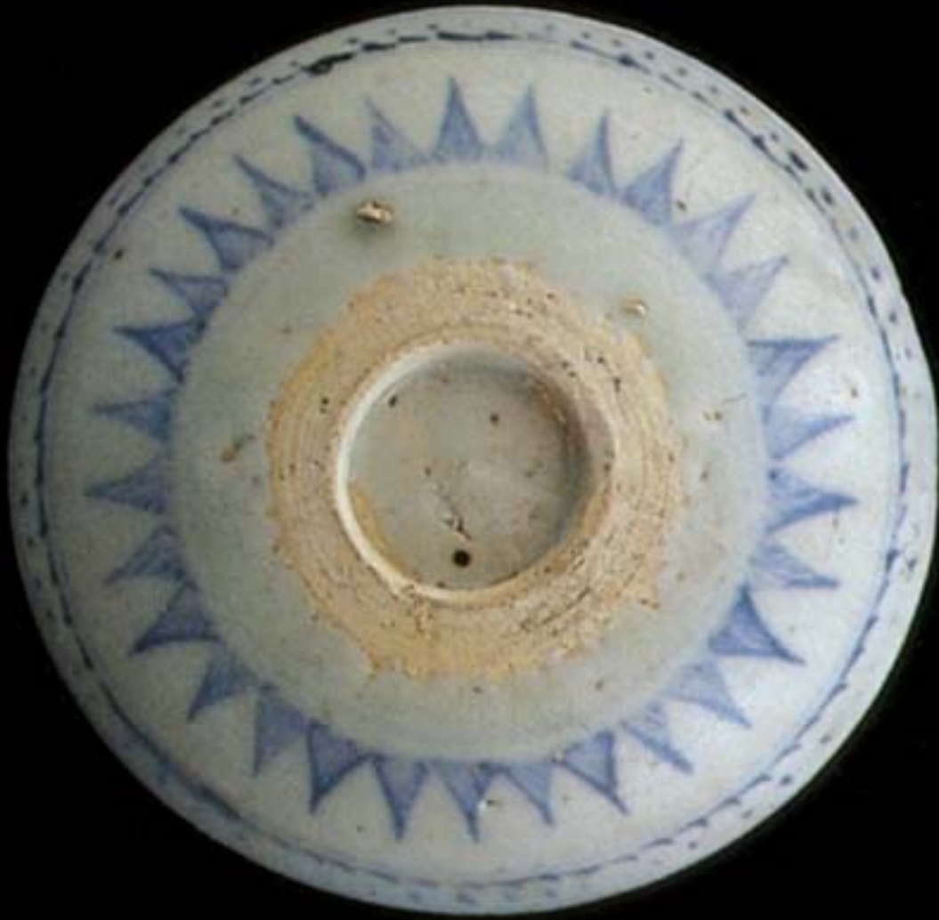
Hole-bottom saucer (base) Chinese; diam. 10 cm.