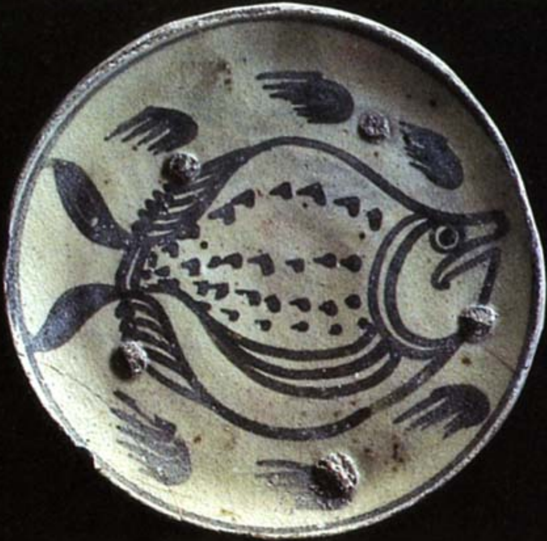
Fish (shard); Sukhothai, Thailand.