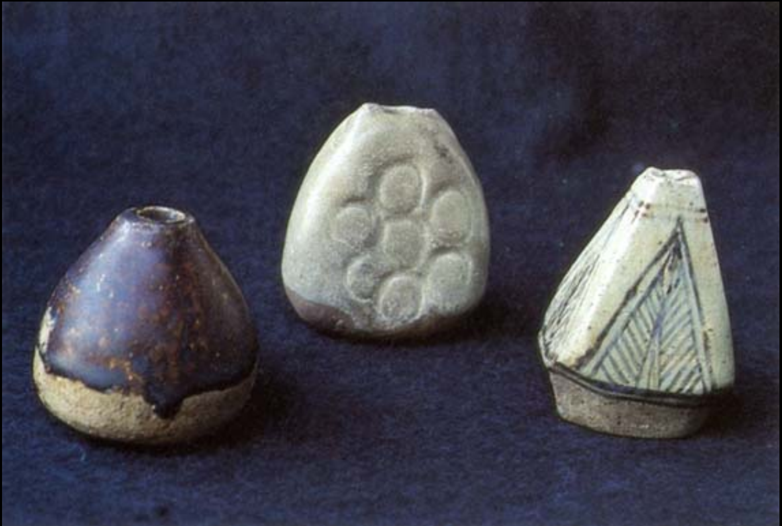
Weights Sisatchanalai, Thailand; avg. ht. 6 cm.