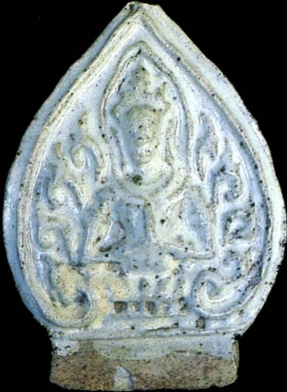
Tile; Sisatchanalai, Thailand; ht. 13 cm.