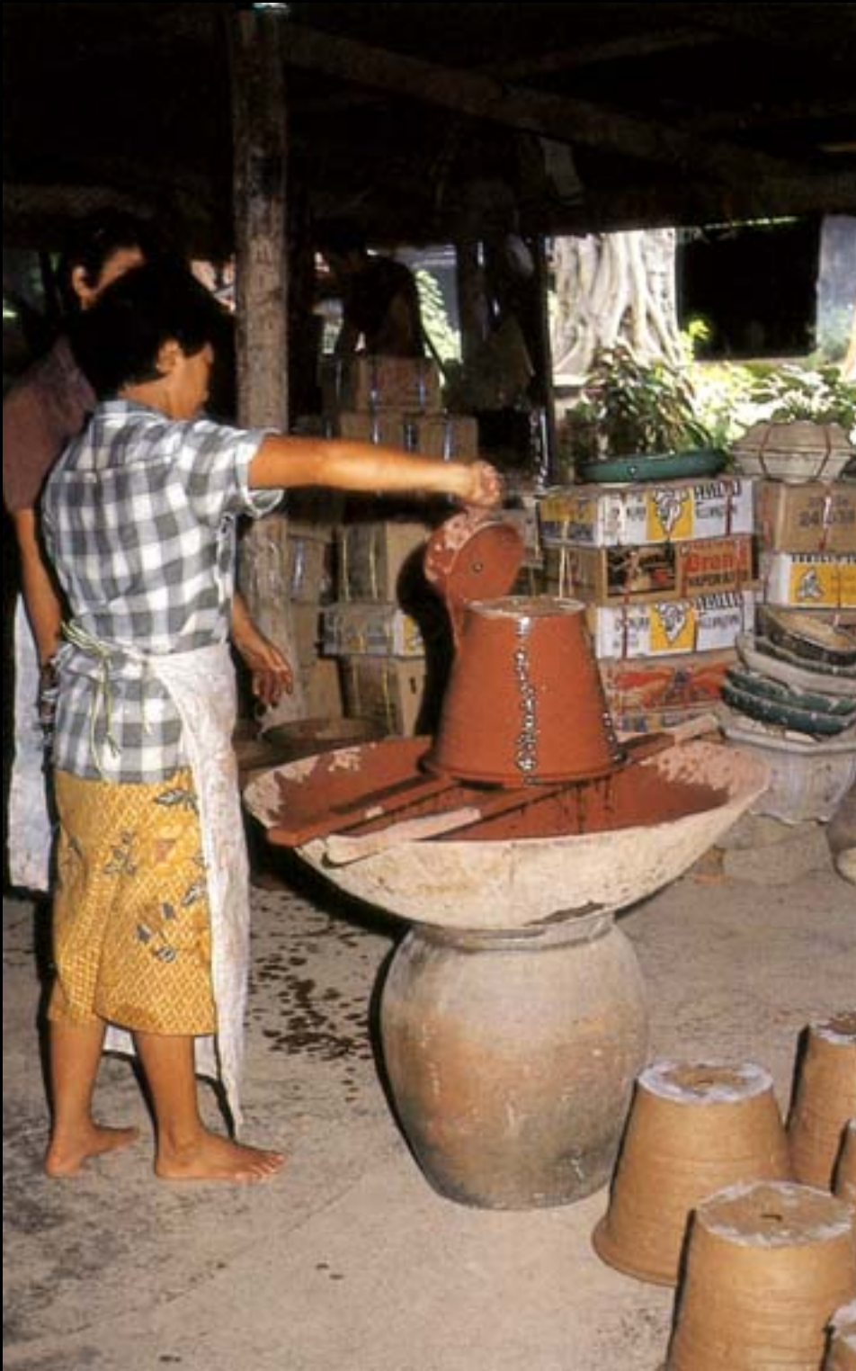
Glazing: Tao Hung Thai Kilns, Ratchaburi, Thailand (Vance Childress).