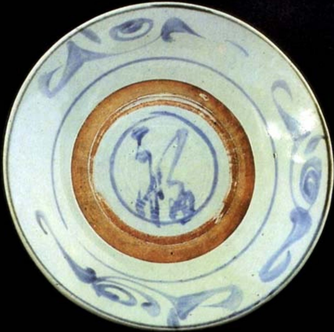
Plate (blue and white tableware);Chinese; diam. 28 cm.