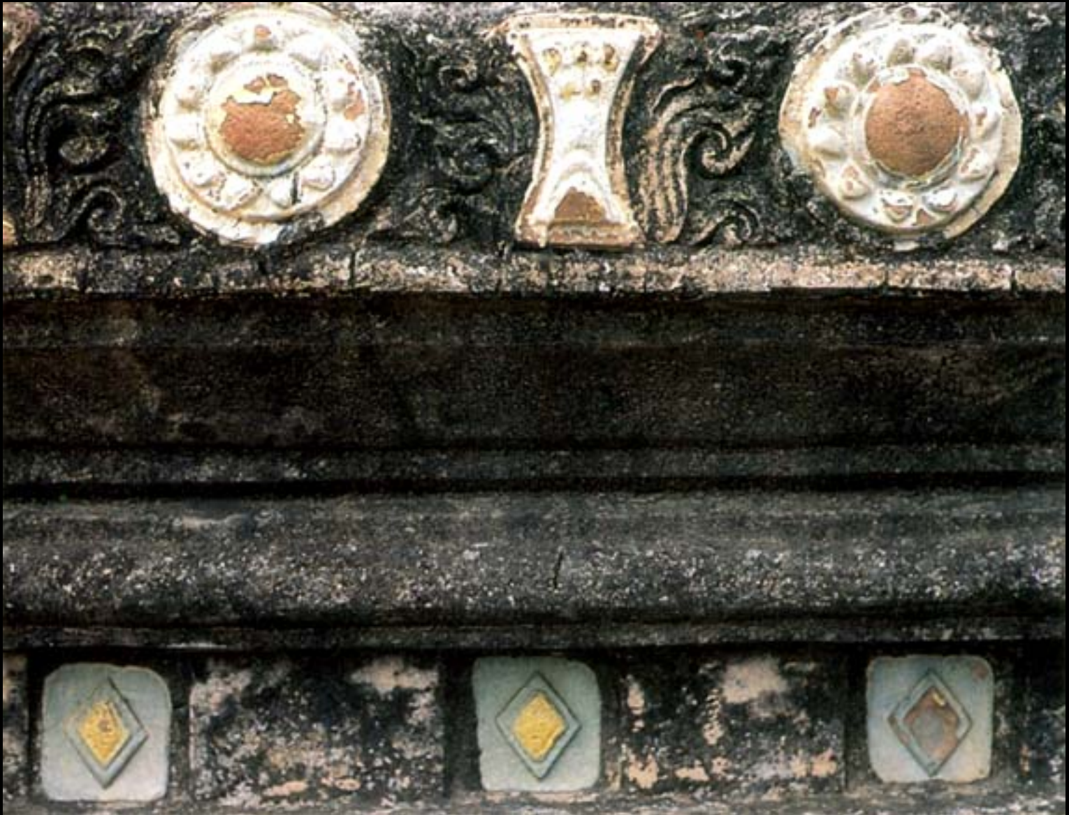
Tiles; Sulamani pagoda, Burma.