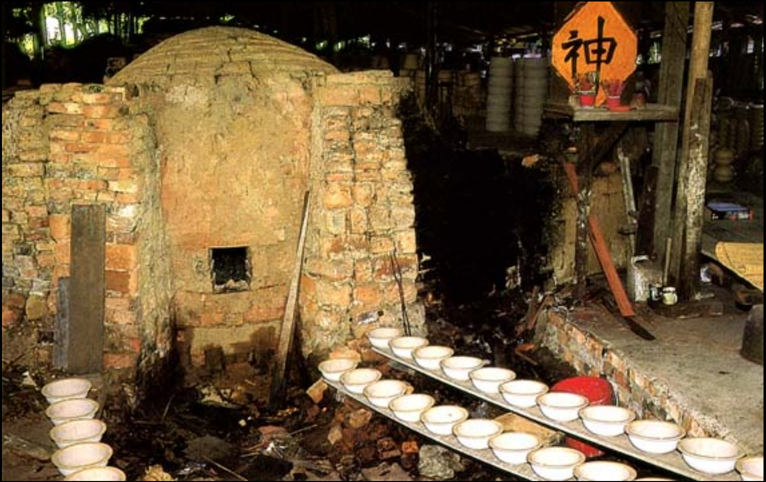
Siam Mui Kuan Kilns, Singapore.