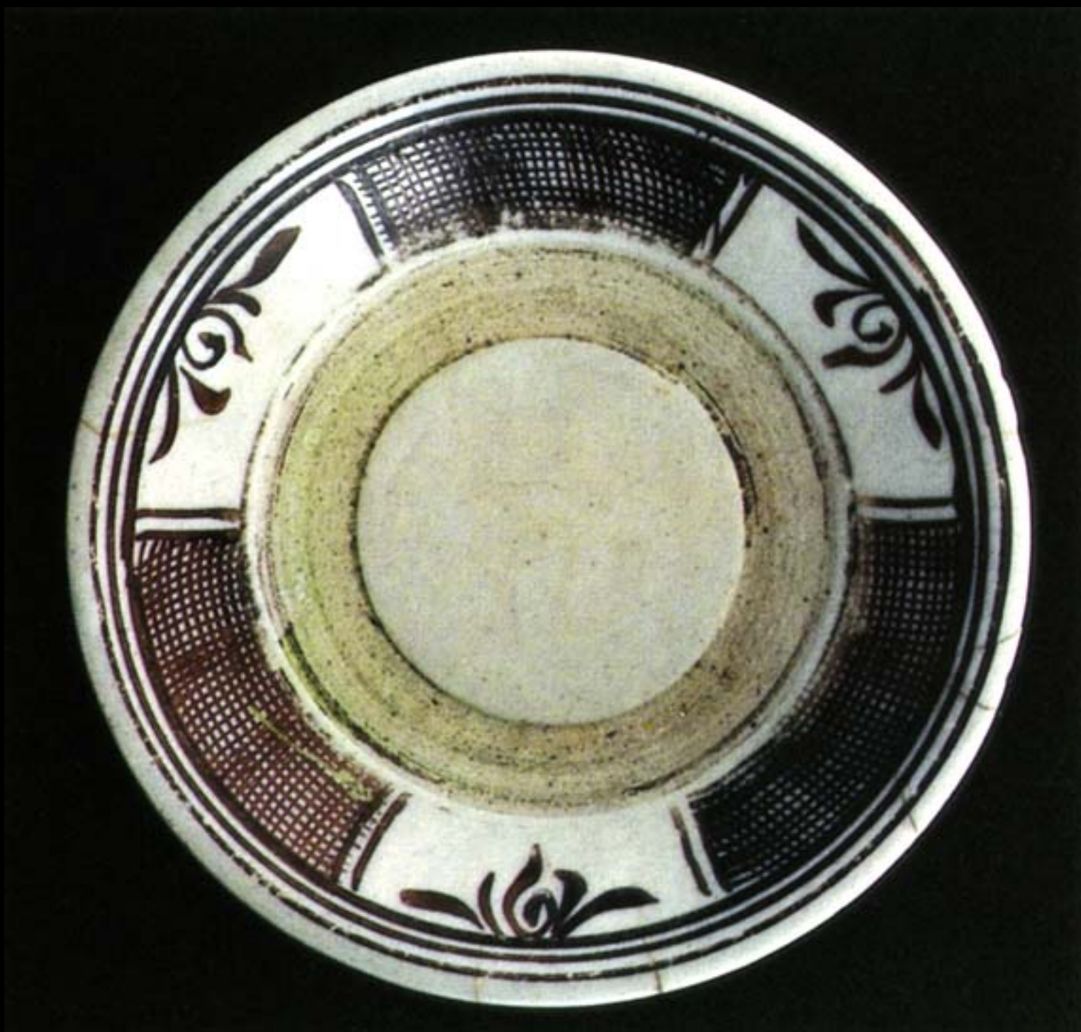
Enamel plate; Chinese; diam. 16 cm.