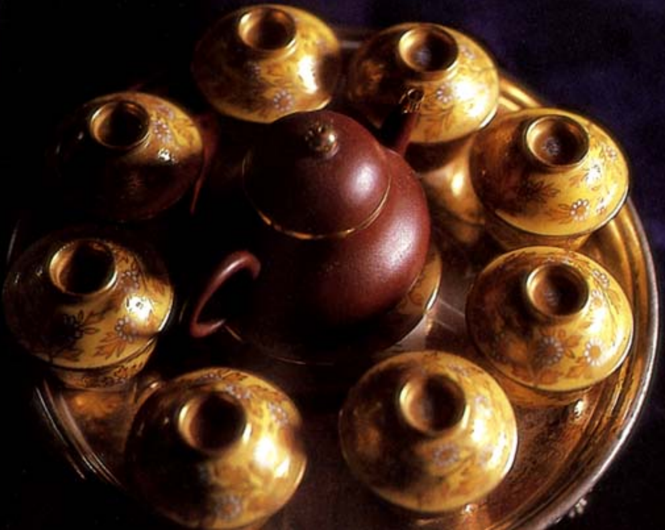
Tea set, Vimanmek Palace, Bangkok, Thailand.