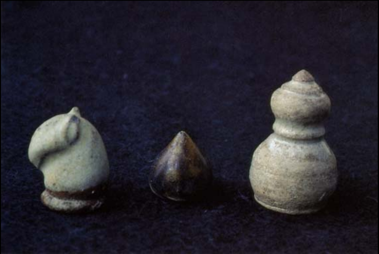
Chess pieces; Sisatchanalai, Thailand; avg ht. 2.5 cm.