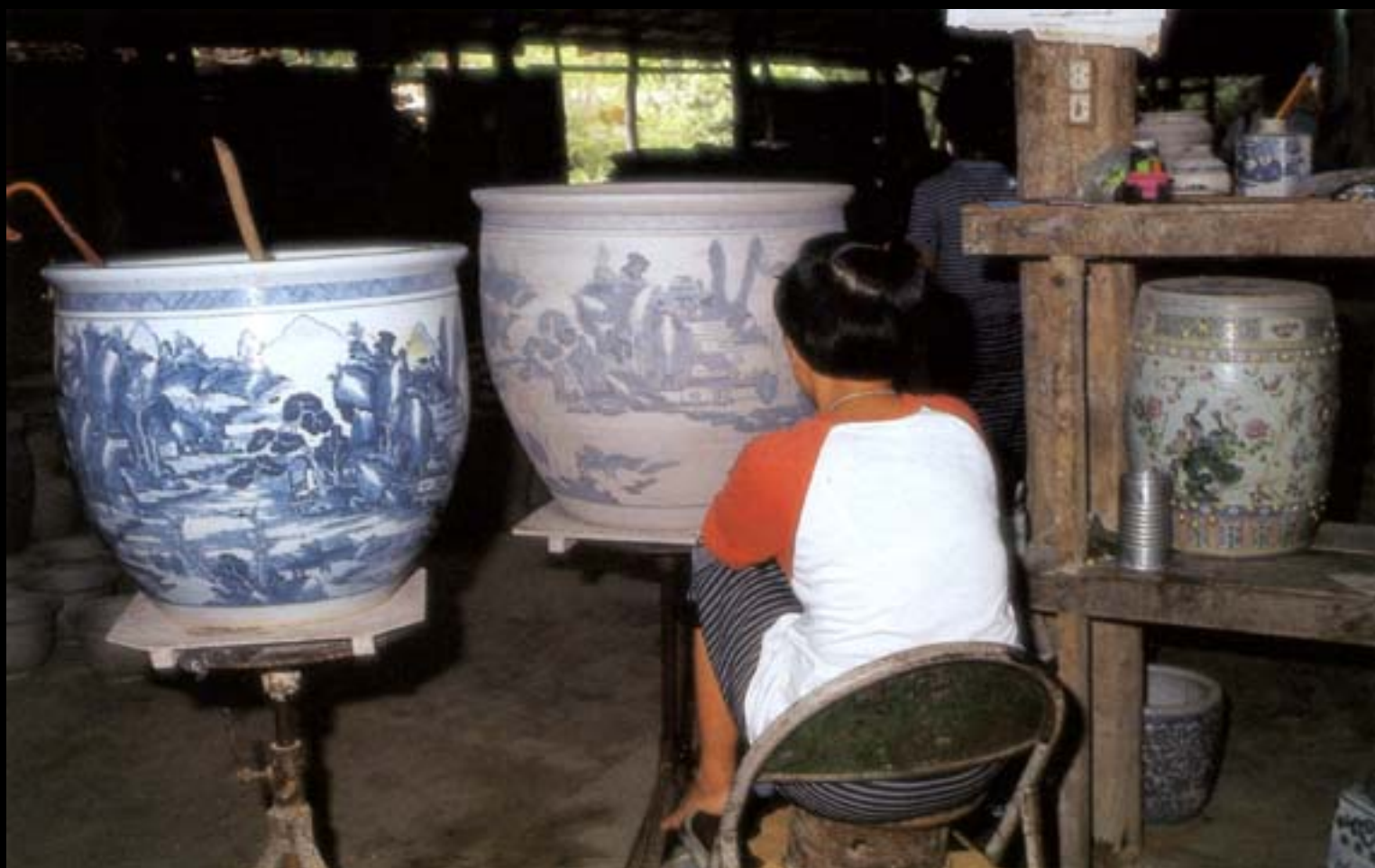
Copying a design: Tao Hung Thai Kilns, Ratchaburi, Thailand (Vance Childress).